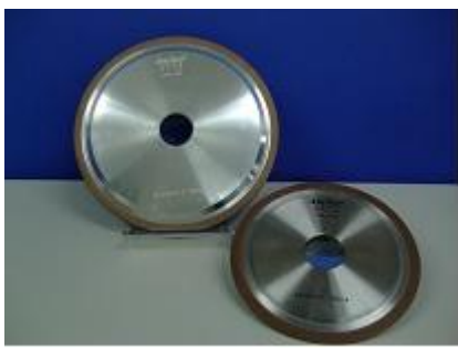
Grinding Wheels for HSS Saw Blade