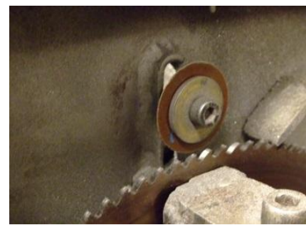
Grooving process of HSS Saw Blade